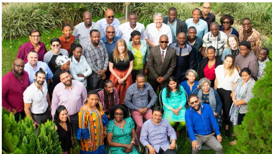
MenEngage Alliance Participants at the Symposium planning meeting in Kigali, Rwanda, February 2020

Support remote participation , by organizing a local or regional gathering to attend a plenary or specific session virtually. This can be followed by discussion with participants with calls to action focused on local needs and realities.