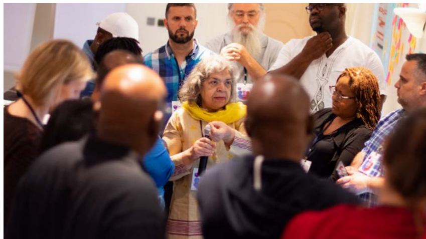
MenEngage Alliance Strategy meeting, Beirut, June 2019

The Symposium will bring together participants from diverse sectors, including activists, researchers, practitioners and students from civil society and the international development sector, policy makers, private sector and the donor community.