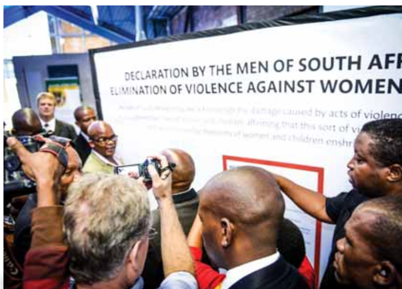
A declaration by men to eliminate GBV in South Africa, signed by the Deputy President of South Africa Kgalema Motlanthe, provincial chairpersons of the South African National AIDS Council and representatives from civil society, the private sector and government.

All legally binding international human rights treaties have a monitoring component. Monitoring implies the right of individuals to complain and seek a remedy in case the national authorities fail to fulfil their obligations. These mechanisms foster accountability and, over the long term, strengthen the capacity of State parties to fulfil their commitments and obligations.