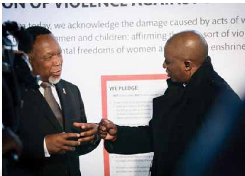
South Africa's Deputy President, being interviewed for a morning talk show, discussing the national dialogue being convened on GBV and the pledge being made by men to eliminate GBV in South Africa.