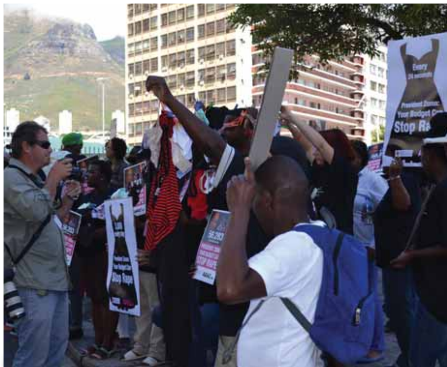
Protesters outside Parliament in Cape Town, South Africa, appealing to President Jacob Zuma to establish a R1 million fund to address GBV levels in South Africa.