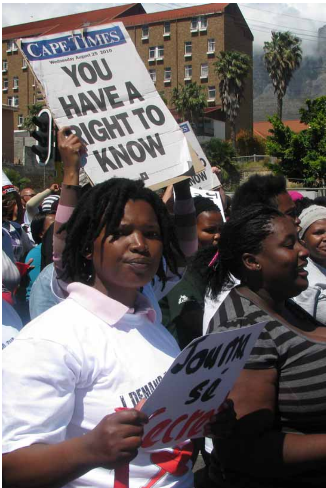
Protesters demonstrating against the Protection of State Information Bill, "Secrecy Bill", in Cape Town, South Africa.